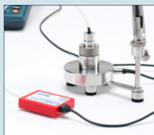
Type 43AC – IEC 60318-4 Occluded-ear Simulator for calibrating earphones coupled to the ear by ear-inserts (711). Here shown with earphone 3A

This configuration is typically used for headsets like TDH-39 & 49.