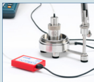
Type 43AB – IEC 60318-5 Reference Coupler (2cc) shown with insert earphone 3A

This configuration is typically used for earphones like model 3A and 5A.