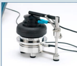
Type 43AF – IEC 60318-3 Reference Coupler (6cc) shown with supra-aural audiometric headset TDH 39

This configuration is typically used for headsets like HDA-200, TDH-39 & 49, and DT 48.