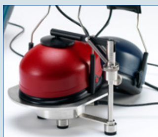
Type 43AA – IEC 60318-1 & 2 Ear Simulator & Coupler (318) shown as IEC 60318-2 with circum- aural audiometric head- set HDA-200

of pressure force and compatibility with all commercially available audiometric headsets and earphones. For non-standard, custom made configurations please contact G.R.A.S.