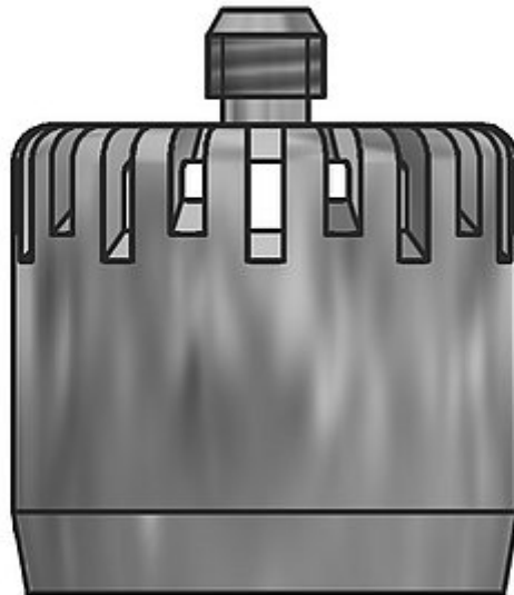
1/4" microphone protection grid with M1,6 thread on top