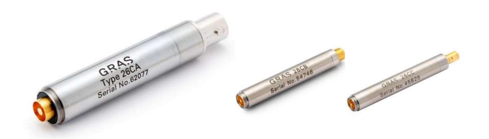
Figure 3. Left: ½" CCP preamp with BNC connector. Middle: ½" CCP preamp with Microdot 10/32 connector. Right: ½" CCP preamp with SMB connector.

Constant Current Power supply, which must be between 2 mA and 20 mA (nominally 4 mA), to produce a constant nominal voltage level of 12 Volt DC (referred to as the bias voltage) to drive the preamplifier. The output signal from the microphone superimposes fluctuations around the DC level.