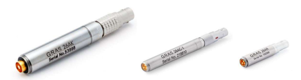
Figure 2. Left: ½" Traditional preamp with 7-pin LEMO style connector. Middle: ½" Traditional preamp with 5-pin LEMO style connector. Right: ½" Traditional preamp with 4-pin LEMO style connector.

Traditional preamplifiers are typically using variations of multi-pin LEMO style connectors like 4, 5 and 7-pin and multi-wire cables (Figure 12).