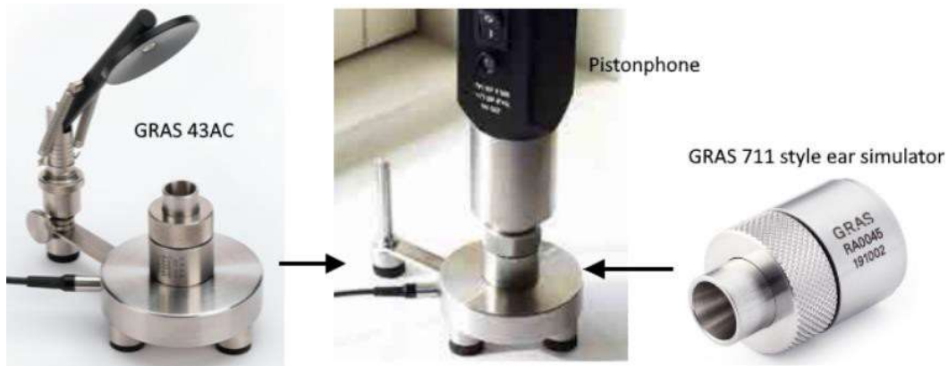
Figure 2. 711 style ear simulators (like the one include in GRAS 43AC) have a built-in non-removable microphone that has to be calibrated together with the coupler which will create the need of using correction factors when calibrating with a pistonphone or sound calibrator.

GRAS KEMAR head and torso simulator has many configurations where 711 style ear simulators are used. On the table below it is possible to see that, depending on the calibration setup and frequency used, we will have to use different correction factors for the calibration: