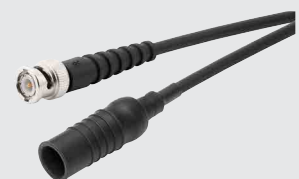
Rubber-sleeved, watertight cable