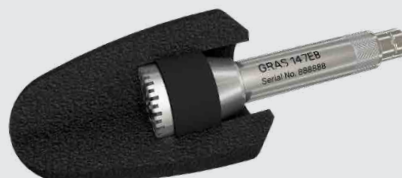
Large, custom-designed windscreen