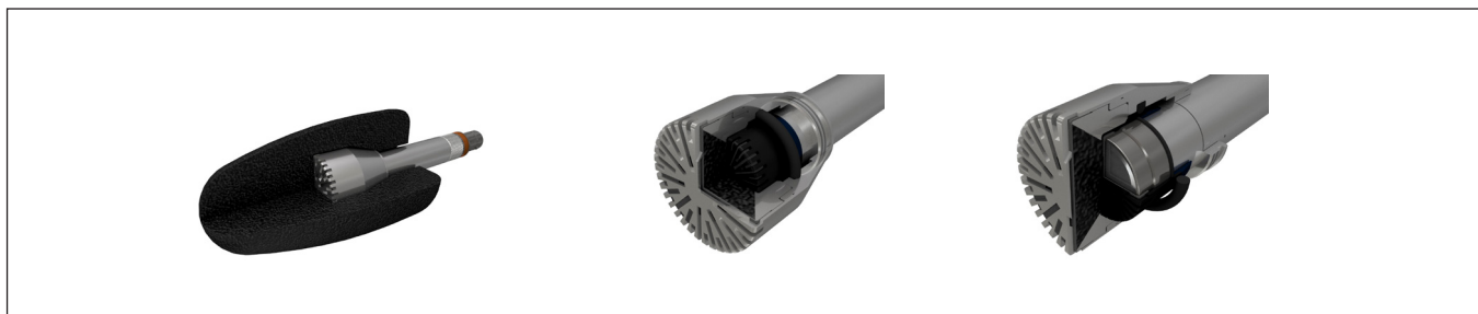
Fig. 1. Three layers of protection: Windscreen on top of 1" protection grid on top of 1/2" protection grid. Both grids have built-in acoustically transparent filters.

The 147EB microphone set for wheelhouse brake testing consists of a robust microphone set and three layers of protection. The basic microphone set consists of a preamplifier which is designed to resist shocks and vibration, and a microphone capsule with a diaphragm which is a more robust type than that conventionally used on measurement microphones. The preamplifier/microphone assembly is watertight to IP67, the venting is protected against water and the BNC connector is also watertight. A windscreen and two protection grids with built-in filters provide easily exchangeable protection.