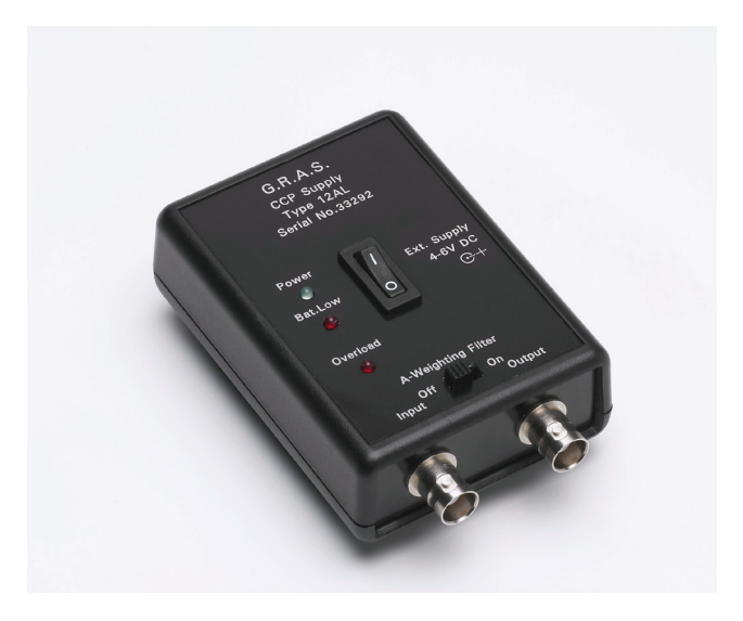
The CCP Supply Type 12AL Fig. 1.1

The Type 12AL has zero gain since the output signal from the transducer is wired directly via 22 µF to the output connector. Zero gain is also preserved at 1 kHz when the A-weighting network has been switched in.