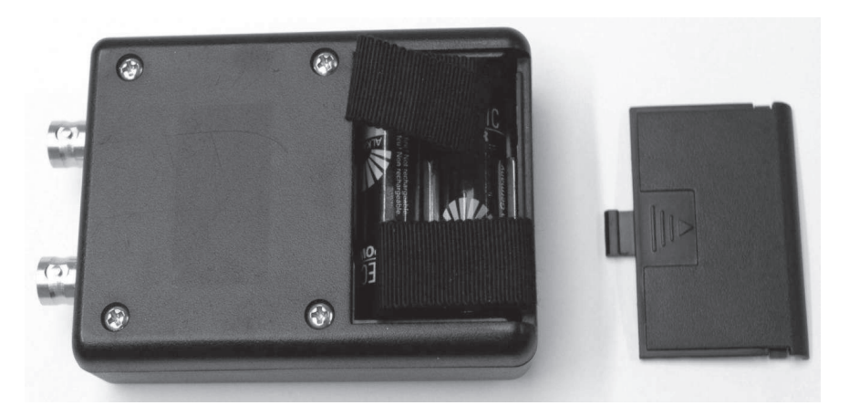
Fig. 3.1 Battery cover removed and battery compartment open: note polarity of batteries

To change the batteries, press and slide out the cover from the battery compartment on the rear panel (see Fig. 3.1). Remove both batteries and replace them with fresh ones, making sure to observe the correct polarity as indicated in the battery compartment. Use alkaline batteries size AA or LR6. Replace the cover of the battery compartment.