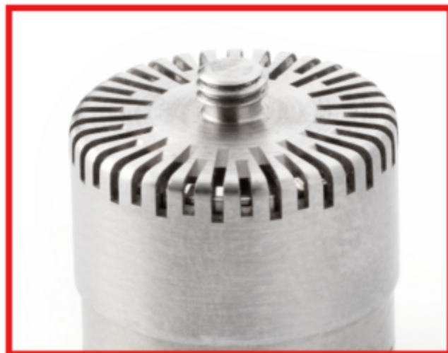
1/2" microphone protection grid with M3 thread on top