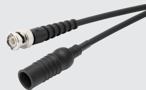
Rubber-sleeved, watertight cable