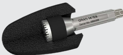
Large, custom-designed windscreen